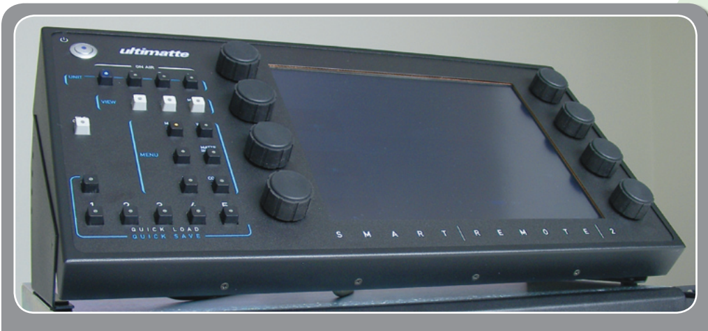
Smart Remote 2 sold separately